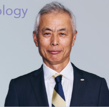
Corporate Officer, GS Yuasa International Ltd. President, GS Yuasa Technology Ltd.

During the term of the Sixth Mid-Term Management Plan, demand for lithium-ion batteries for submarines is expected to remain firm. Orders for various types of batteries for defense applications are increasing year by year, and among them, thermal batteries are projected to increase several times over the current volume. We are proceeding with automation of some processes to accommodate increased production. The demand for replacement lithium-ion batteries for aircraft will expand as the replacement demand for the initially installed batteries expands and volumes will increase. We expect FY2025 results to be similar to those of the previous fiscal year, and we expect the Seventh Mid-Term Management Plan to exceed the results of the Sixth Mid-Term Management Plan.